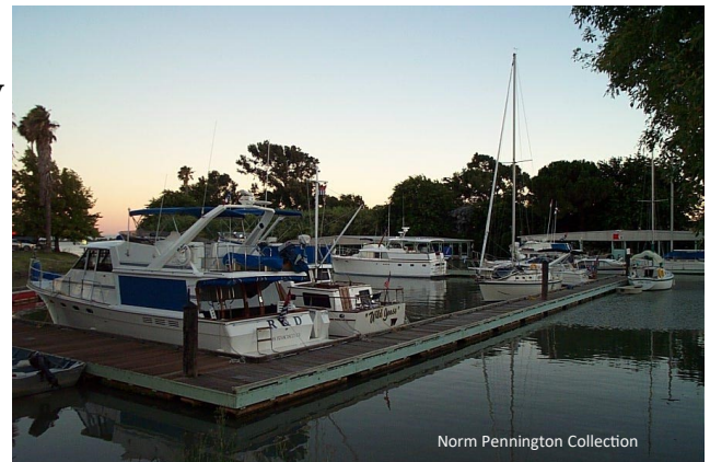
Norm Pennington Collection