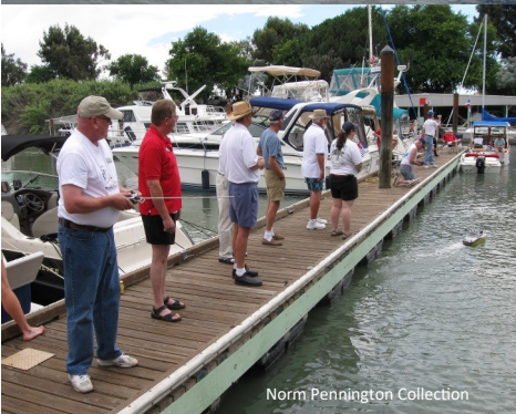
Norm Pennington Collection